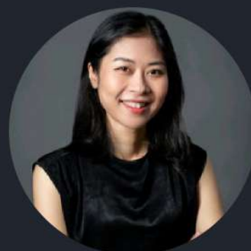
Quynh Dao Deep C Industrial Zones