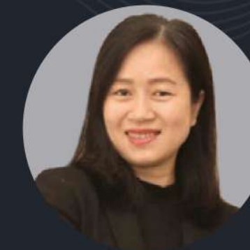
Vy Vu Sonkimland