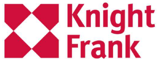
Knight Frank (Vietnam)