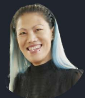
Chau Ta SC Capital