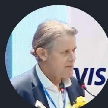
Glenn Hughes LOGOS